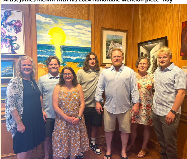
The Fearing Family!